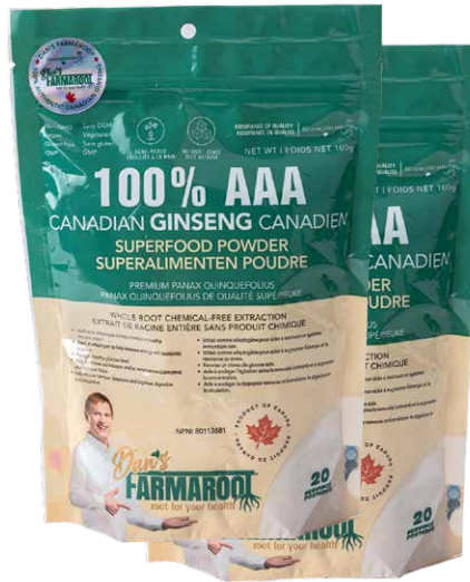
100g 100% AAA CANADIAN GINSENG PURE POWDER (4YEAR)